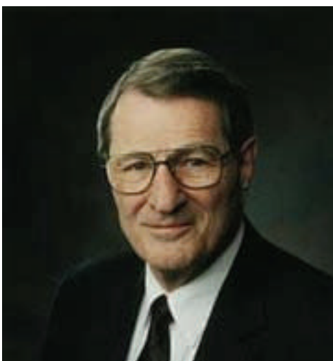
Elder Neal A. Maxwell (1926–2004) of the Quorum of the Twelve Apostles

(“Willing to Submit,” Ensign , May 1985, 71).