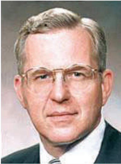
Elder D. Todd Christofferson of the Presidency of the Seventy

“[The Lord] requires ‘the heart and a willing mind’ (D&C 64:34; emphasis added). ... The Lord asks us to open ourselves to Him, holding nothing back. He says to us, seek not ‘thine own life’ ; seek ‘my will, and to keep my commandments’ (Helaman 10:4). The newness of heart comes when we do and give all we can, then offer our heart and will to the Father”