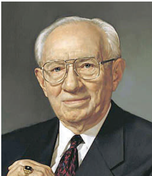
President Gordon B. Hinckley

“It is the mission of the Church of this last dispensation to develop another people who shall live the gospel in its fullness. This people are to become ‘pure in heart,’ and they shall ... be the Lord’s people. They shall walk with God because they shall be of one heart and one mind, and they shall dwell in righteousness, and there shall be no poor among them”