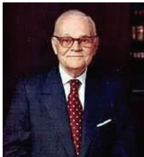
President Marion G. Romney (1897–1988), First Counselor in the First Presidency

(“Except Ye Are One,” Ensign , Nov. 1983, 5).