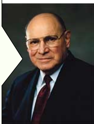
Elder Joseph B Wirthlin

The Church is not a place where perfect people gather to say perfect things, or have perfect thoughts, or have perfect feelings. The Church is a place where imperfect people gather to provide encouragement, support, and service to each other. . . . We are here with the same purpose: to learn to love Him with all our heart, soul, mind, and strength, and to love our neighbor as ourselves.