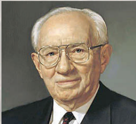
President Gordon B. Hinckley

D&C 84:106: "If any man among you be strong in the Spirit, let him take with him him that is weak, ... that he may become strong also."